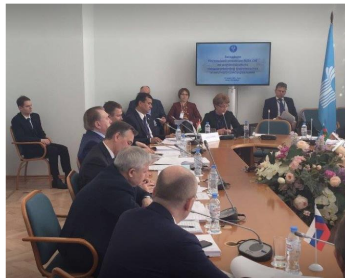
URC at the meeting of Interparliamentary Assembly's Committee on best municipal practices of CIS-countries in St.Petersburg